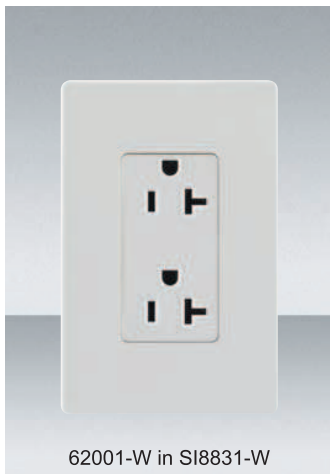
62001-W in SI8831-W