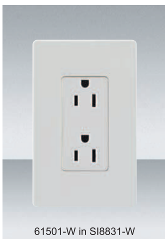
61501-W in SI8831-W

Push-In and Side Wired, Decorator Devices, 2-Pole, 3-Wire Grounding, 15 A 125 V